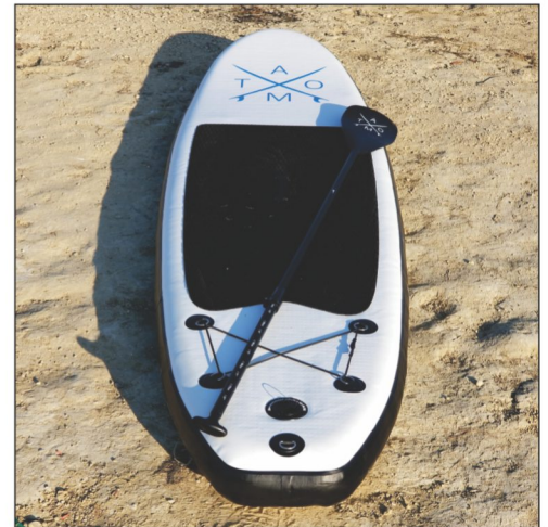
You now are ready to go!