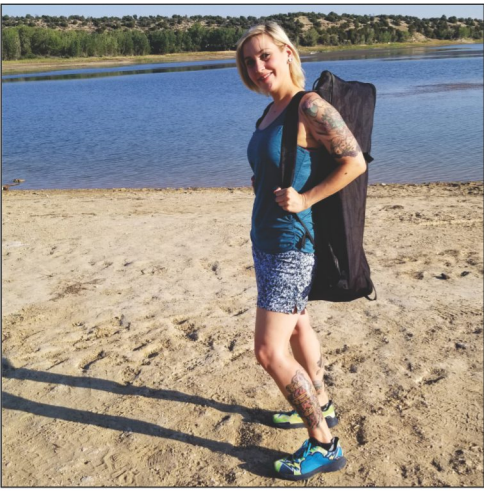
Behold your Atom Inflatable Stand Up Paddle Board securely packed in a durable backpack.