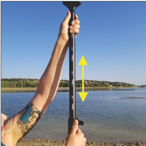
Adjust Handle length to your approximate height.