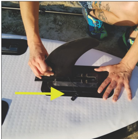
Push Fins into slots.