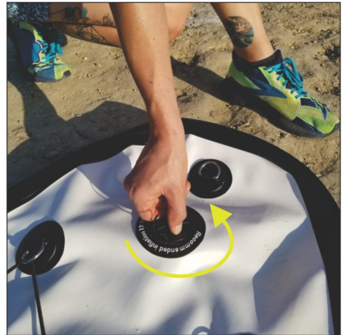
Remove Valve Cap by turning counter clockwise.