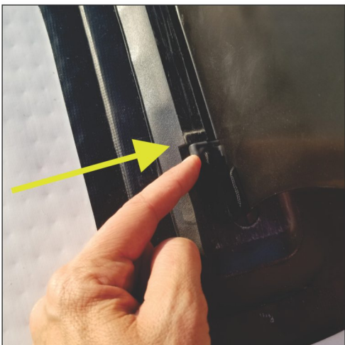
Push until you hear a click indicating it is fully inserted..