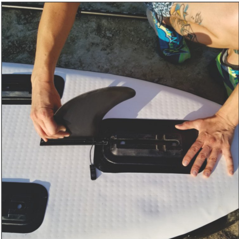
Align Fins into the Fin Slots so that the Fin Arches are facing the rear of the board.