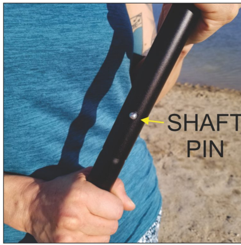
Insert the Center Shaft into the Blade section.