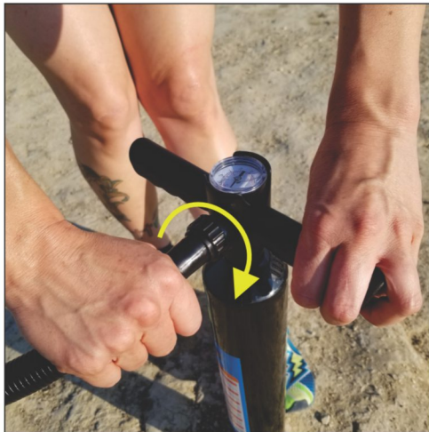
Screw end of hose onto pump in a clockwise direction until tight.