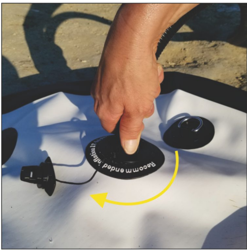
Rotate Hose in a clockwise direction approximately 90 degrees. Collar should be tight and flush with the Valve.