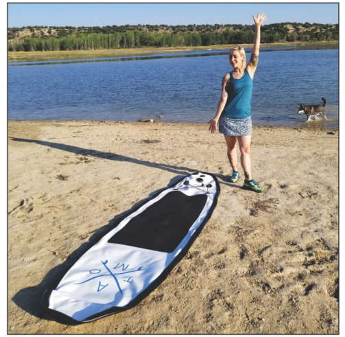
Unfold your board. Make sure top of board, with traction pads and logo, is facing upwards.