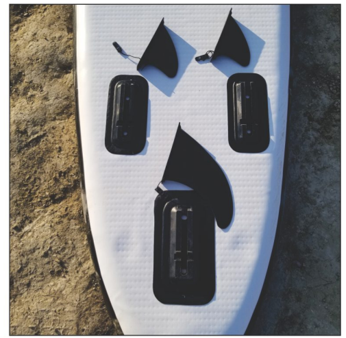
Once filled, flip board over and install Removable Center Fin.