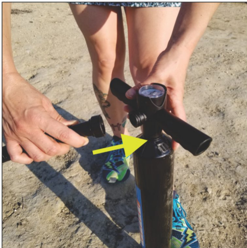
Attach Hose to Pump.