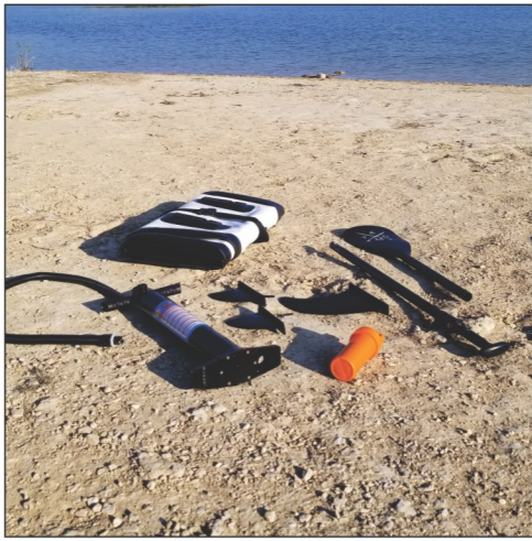
Make sure you have the following items: (1) Board, (1) 3-Piece Paddle, (1) Removable Center Fin, (2) Removable Side Fins, (1) Pump, (1) Pump and Hose, (1) Patch Kit including Patch, Patch Applicator and Glue.