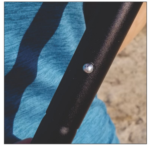
Push Center Shaft into Blade Shaft until Paddle Pin aligns with the Hole in Blade Shaft. You will hear a "click".