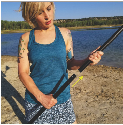
Assemble your Paddle. Paddle has 3 parts. The Handle, the Center, and the Blade.