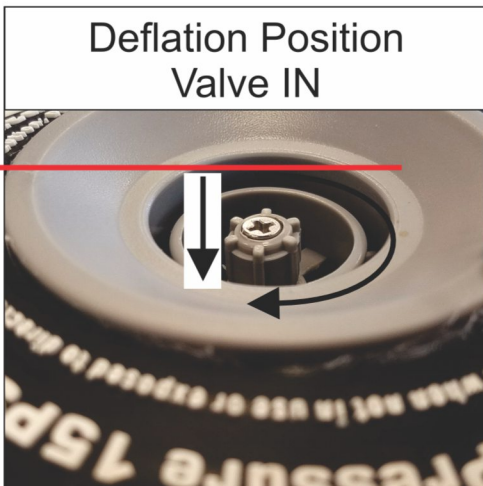
To release air make sure Valve is in the Inward position by pressing down and rotating clockwise.