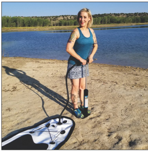
Start pumping. The ideal pressure is 10-15 psi. Refer to pressure gauge on top of pump. Unscrew Hose from Valve and re-attach Valve Cap.