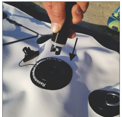
Insert end of Hose into Valve.